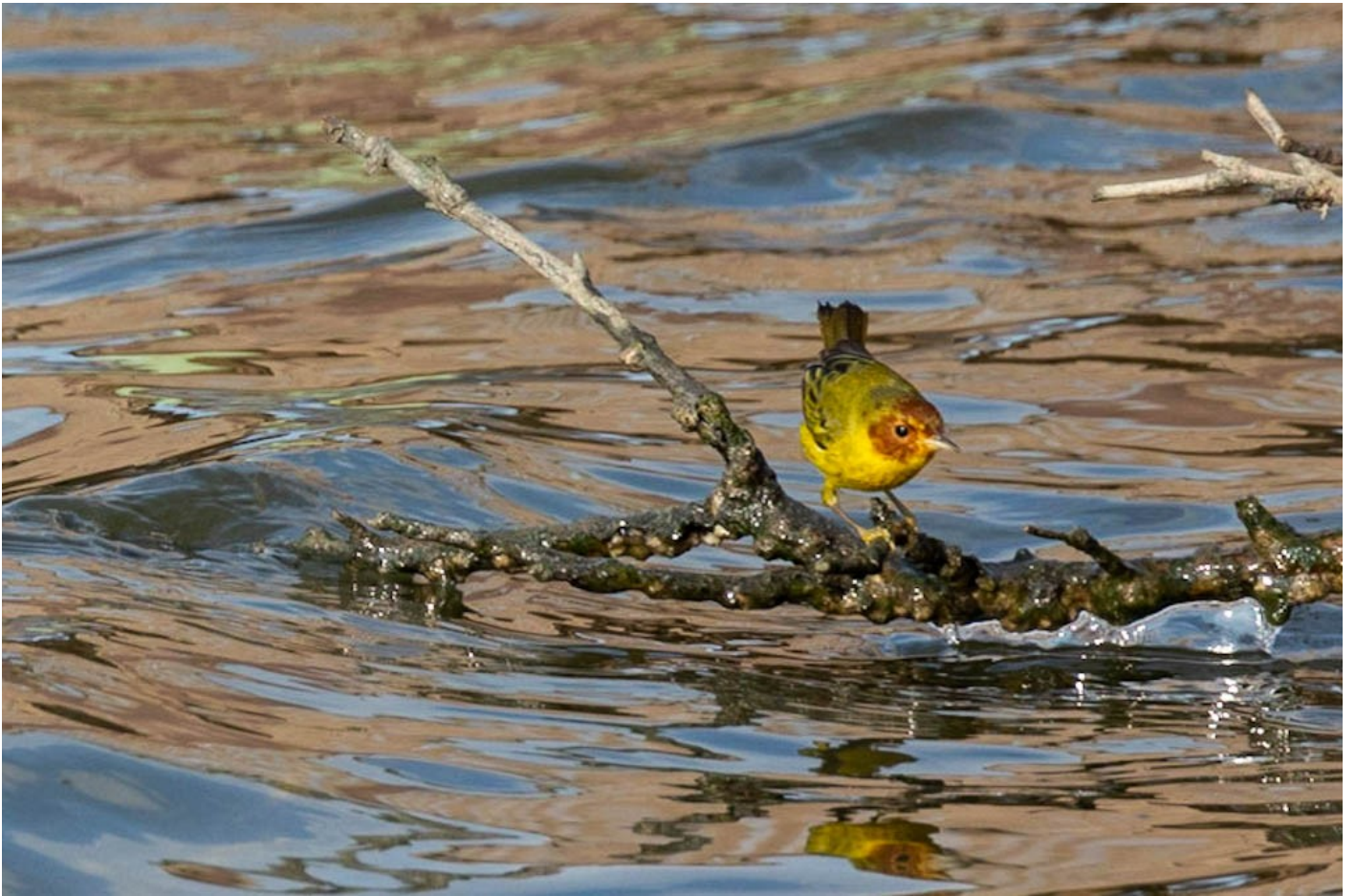
A Yellow "Mangrove" Warbler at South Padre Island Birding and Nature Center. It perches on a branch to get a drink. | 01/08/2023