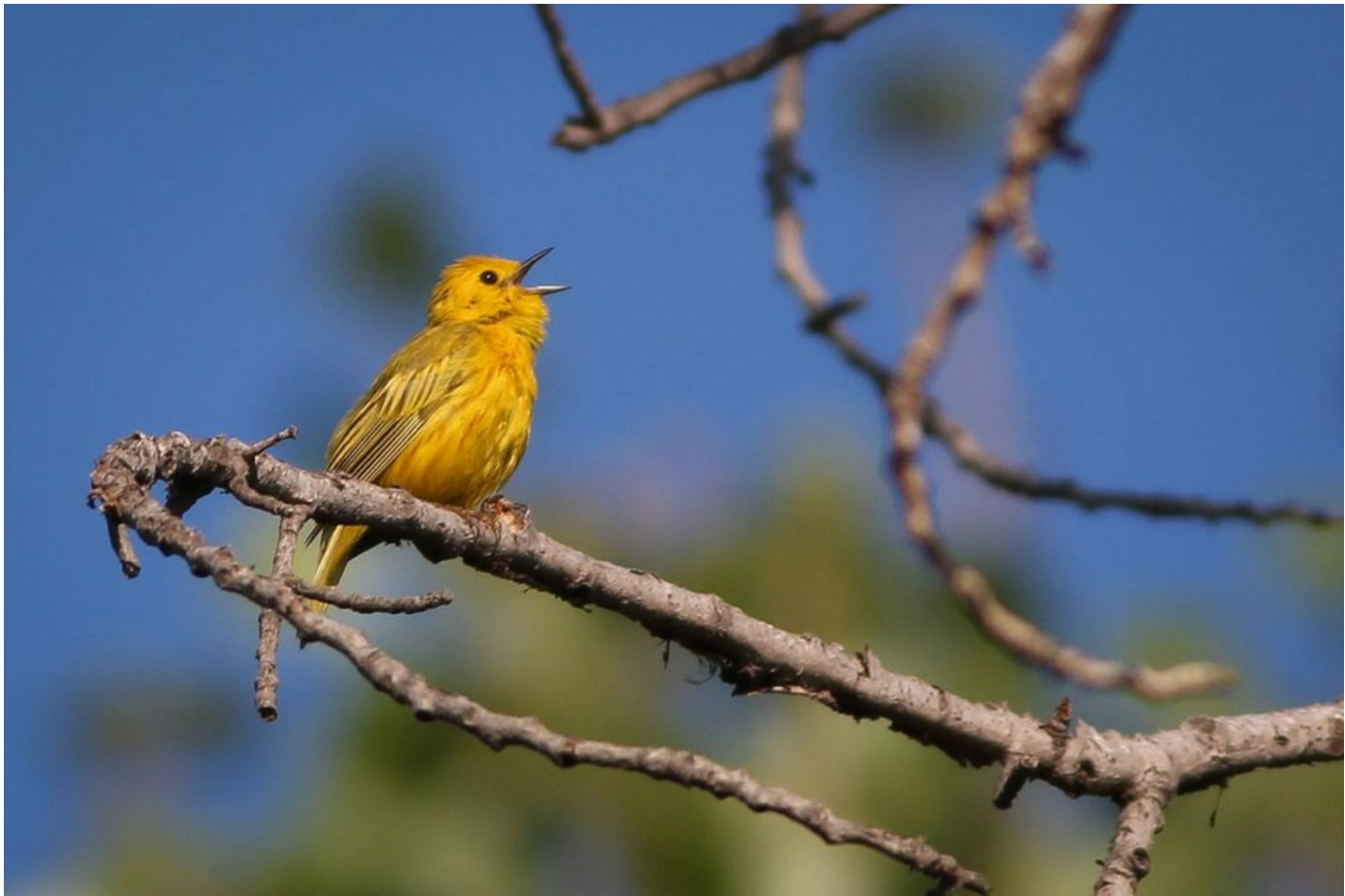
A singing Yellow Warbler | 06/21/2014