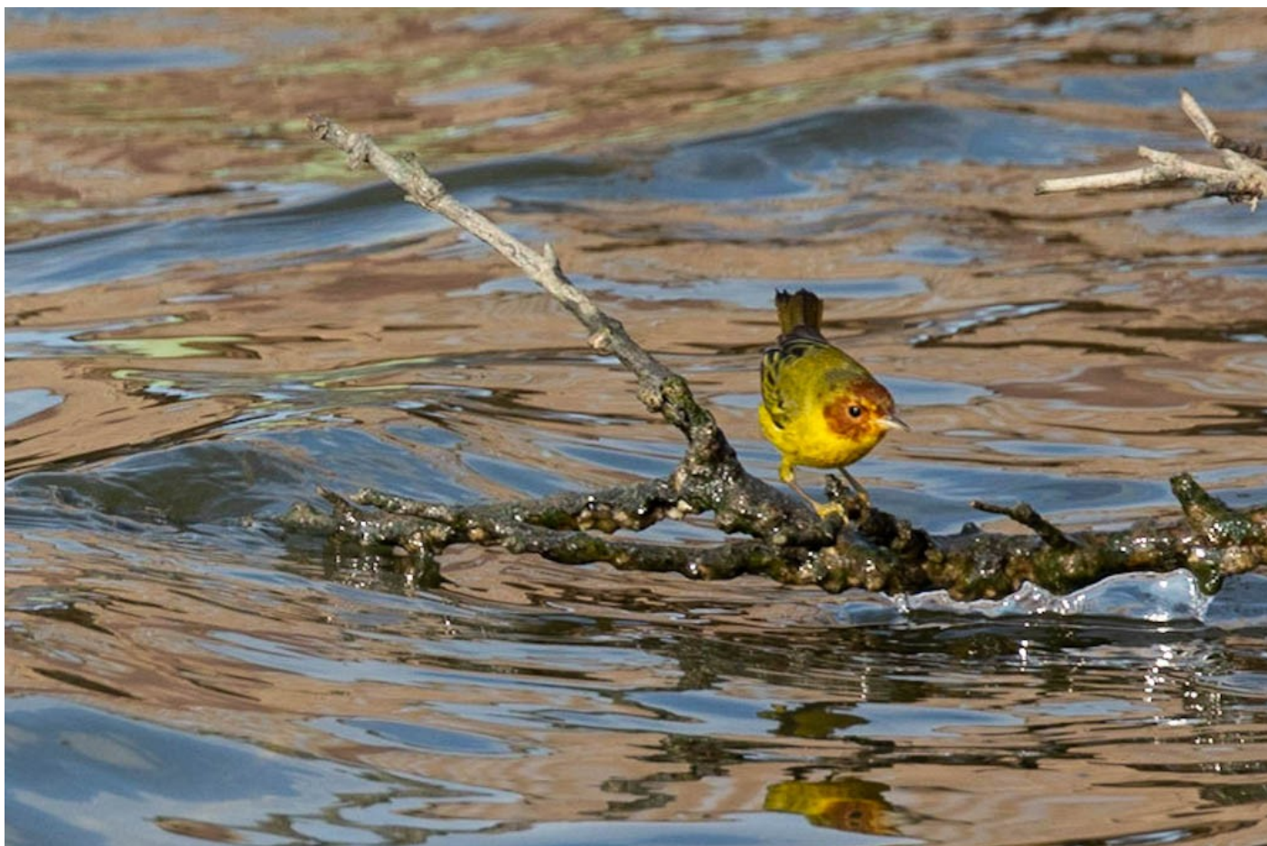
A Yellow "Mangrove" Warbler at South Padre Island Birding and Nature Center. It perches on a branch to get a drink. | 01/08/2023