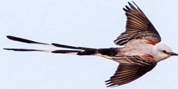
A mid-air view of the Scissor-tailed Flycatcher in flight