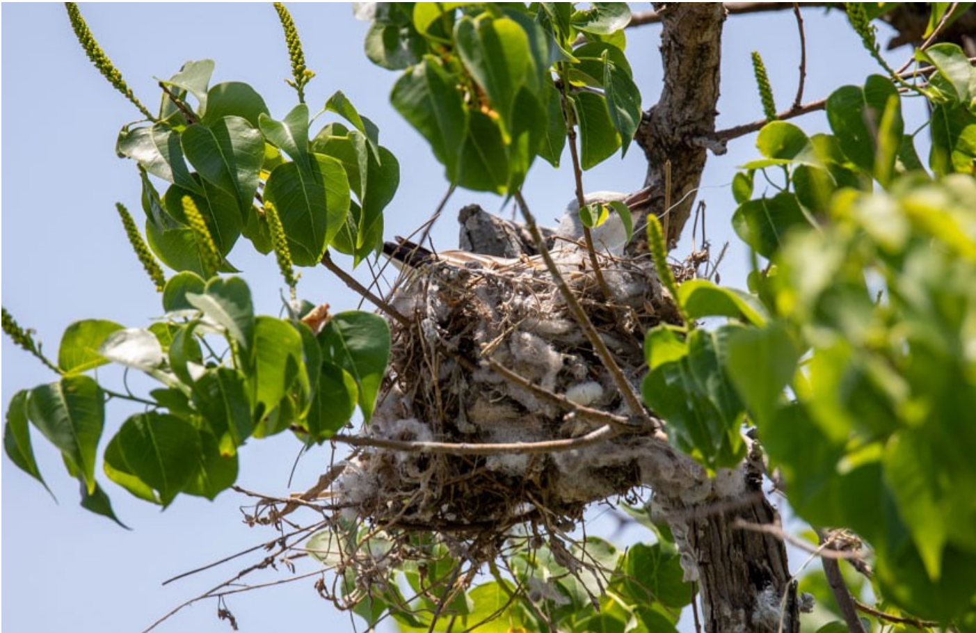
This Scissor-tailed Flycatcher nest I discovered.