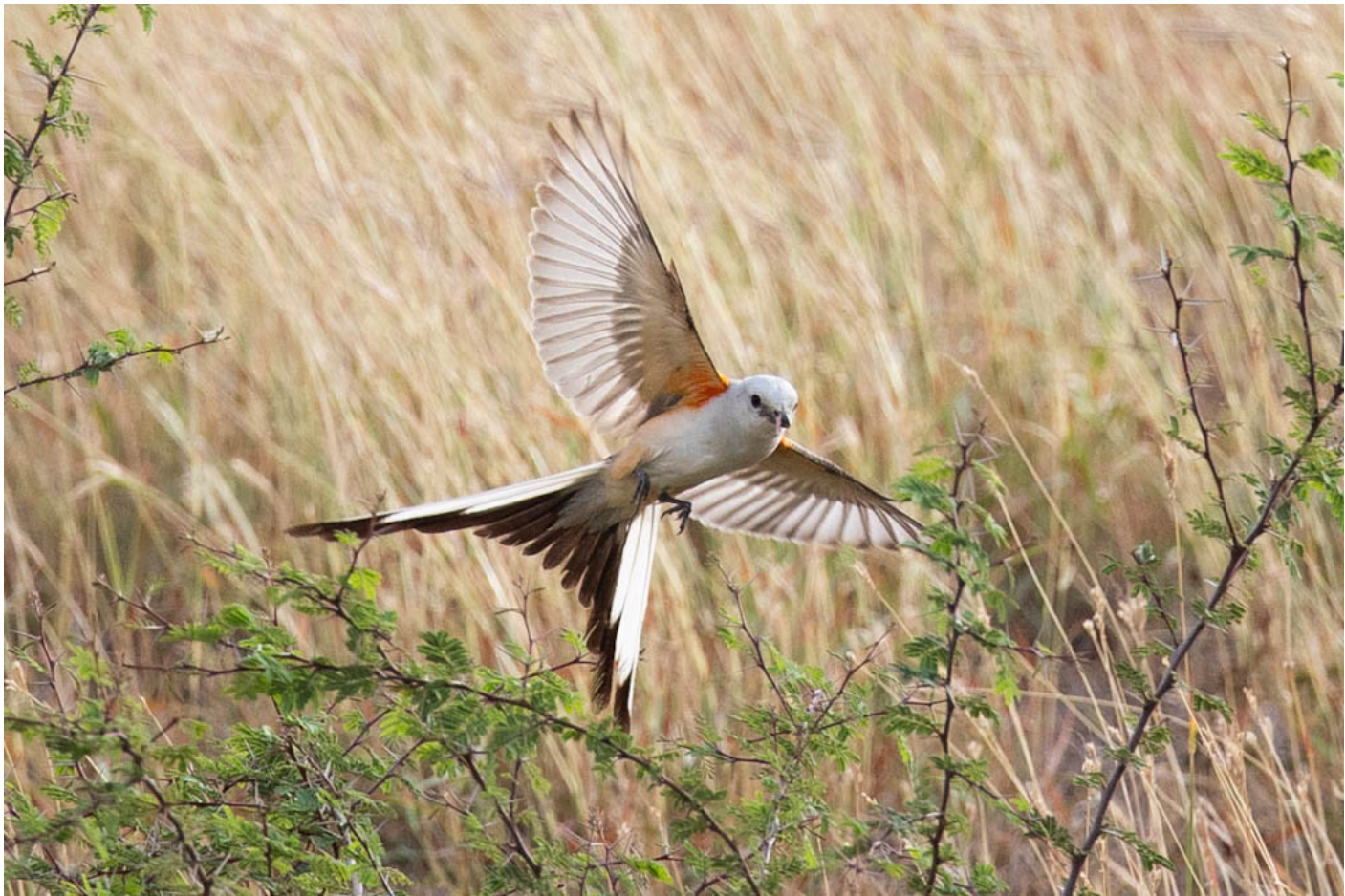
This Scissor-tailed Flycatcher posed nicely for a handful of photos.