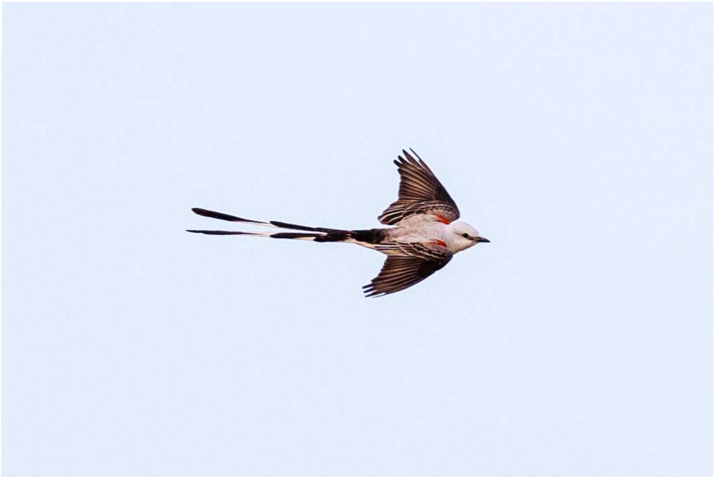
A mid-air view of the Scissor-tailed Flycatcher in flight