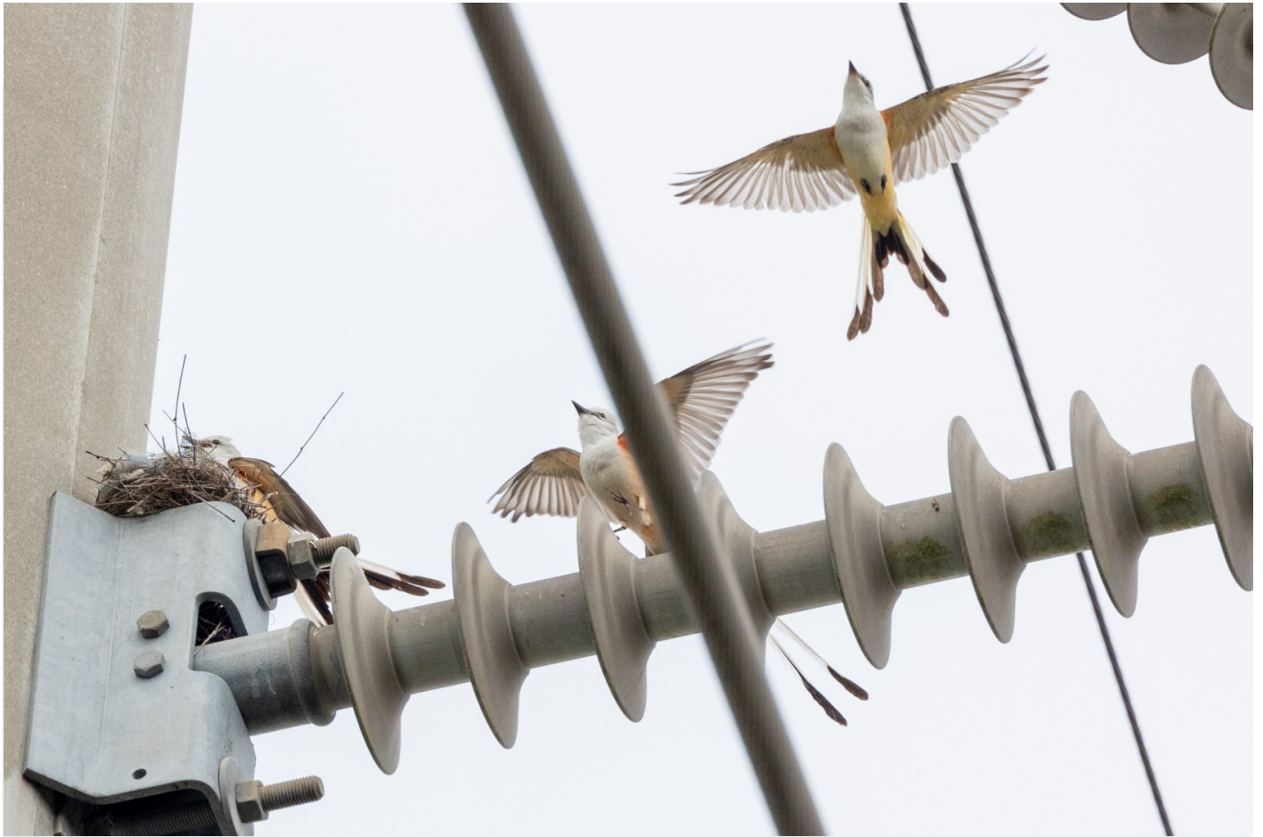
A great example of the varying tail lengths due to age.