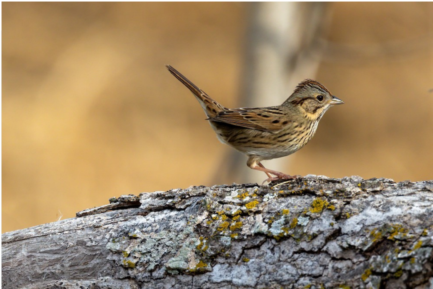
A profile of the Lincoln's Sparrow standing on a log | 01/11/2023