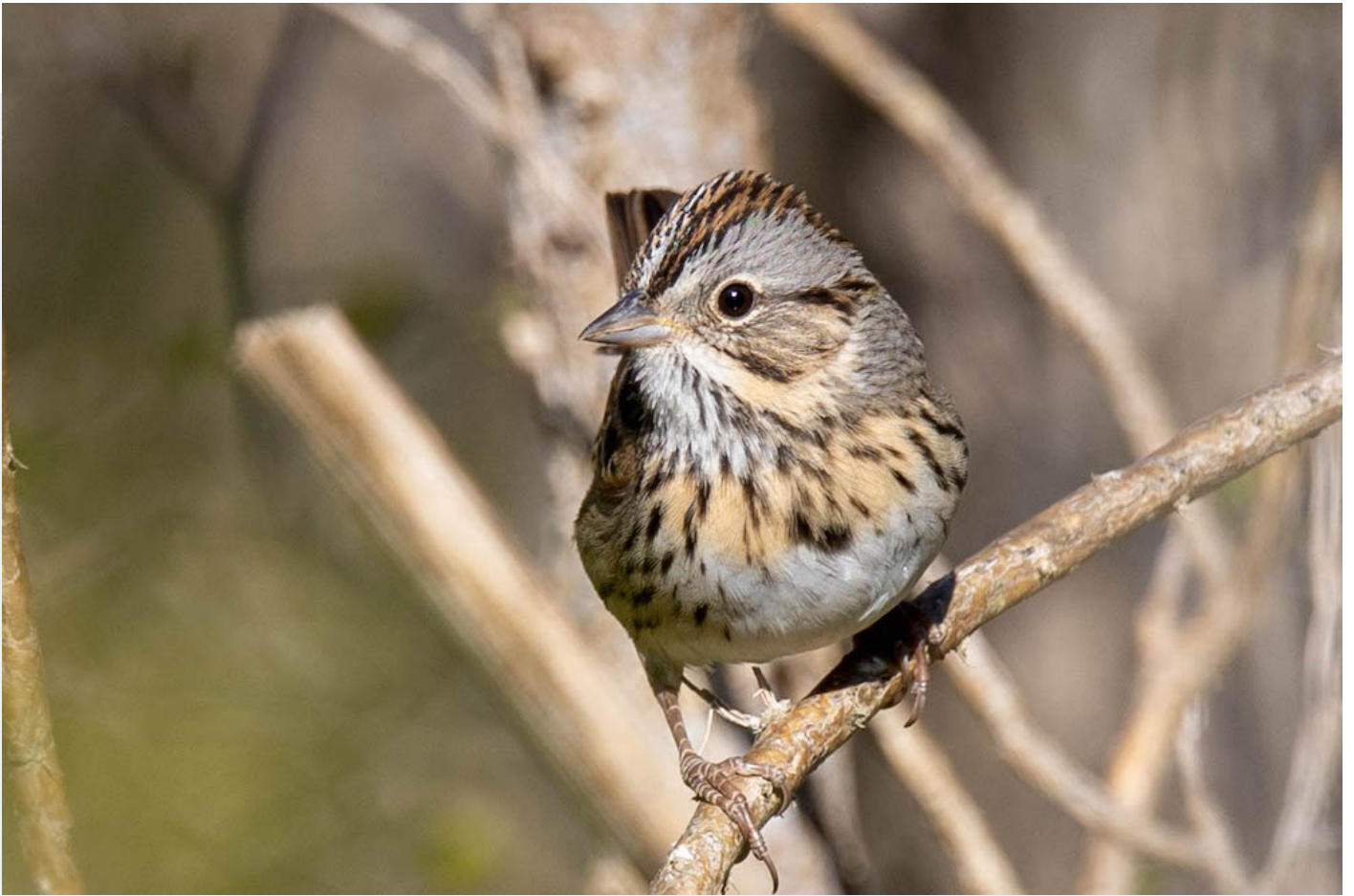
The Lincoln's Sparrow clinging to a branch looking cute with its head turned | 03/13/2022