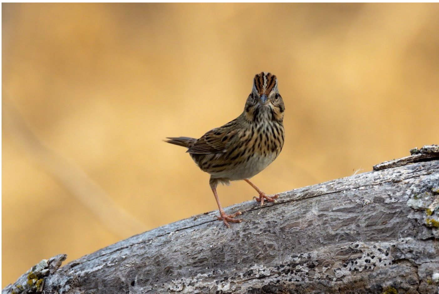
A funny forward-facing pose of the Lincoln's Sparrow. My highest-rated photo on eBird | 01/11/2023