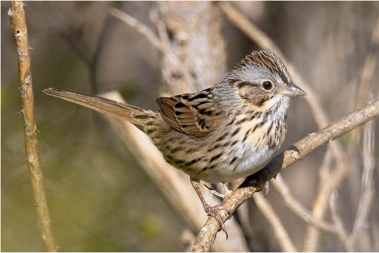
Lincoln's Sparrow on a branch| 03/13/2022