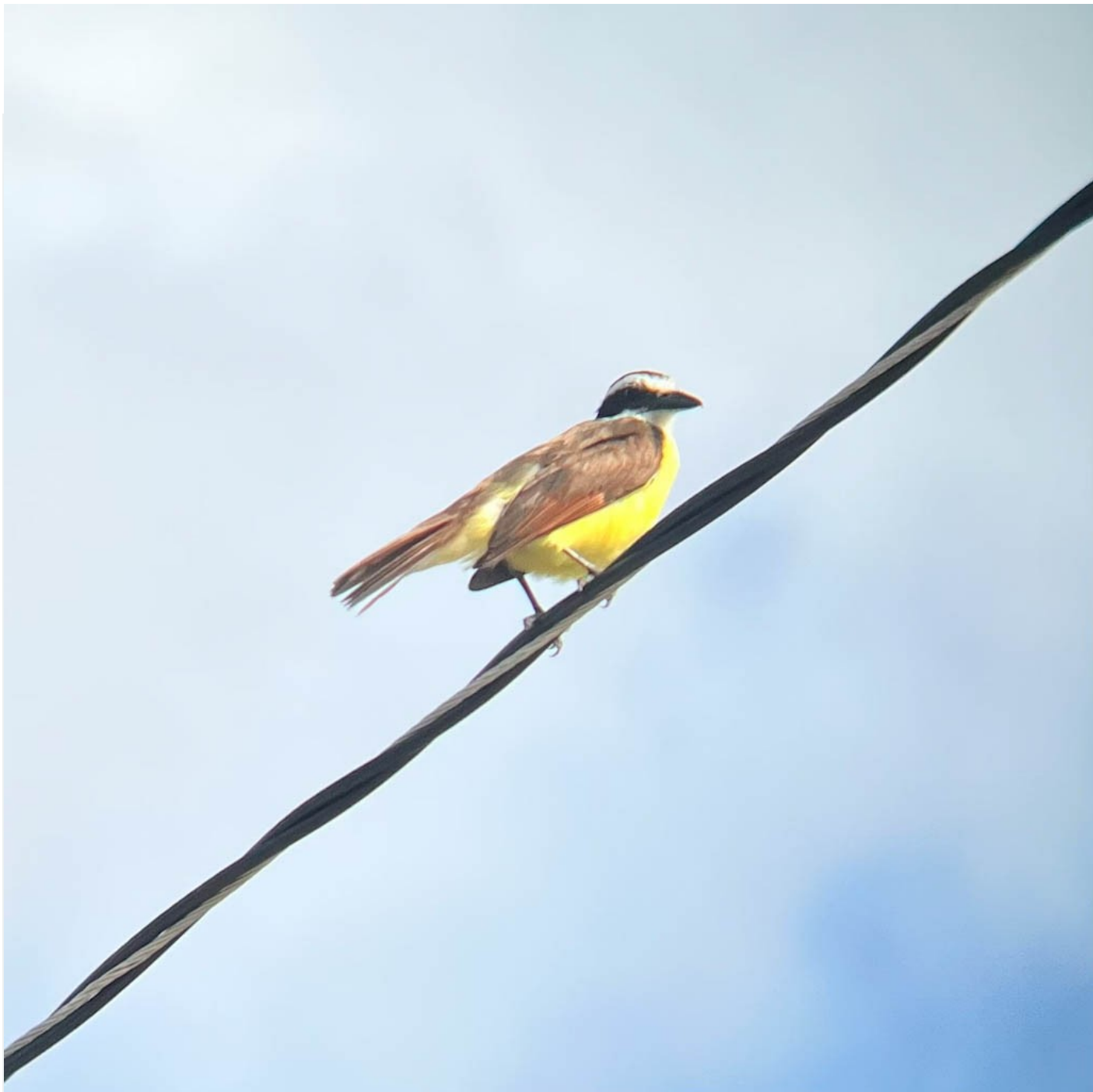
A Great Kiskadee perched on a power line. 07/03/2022