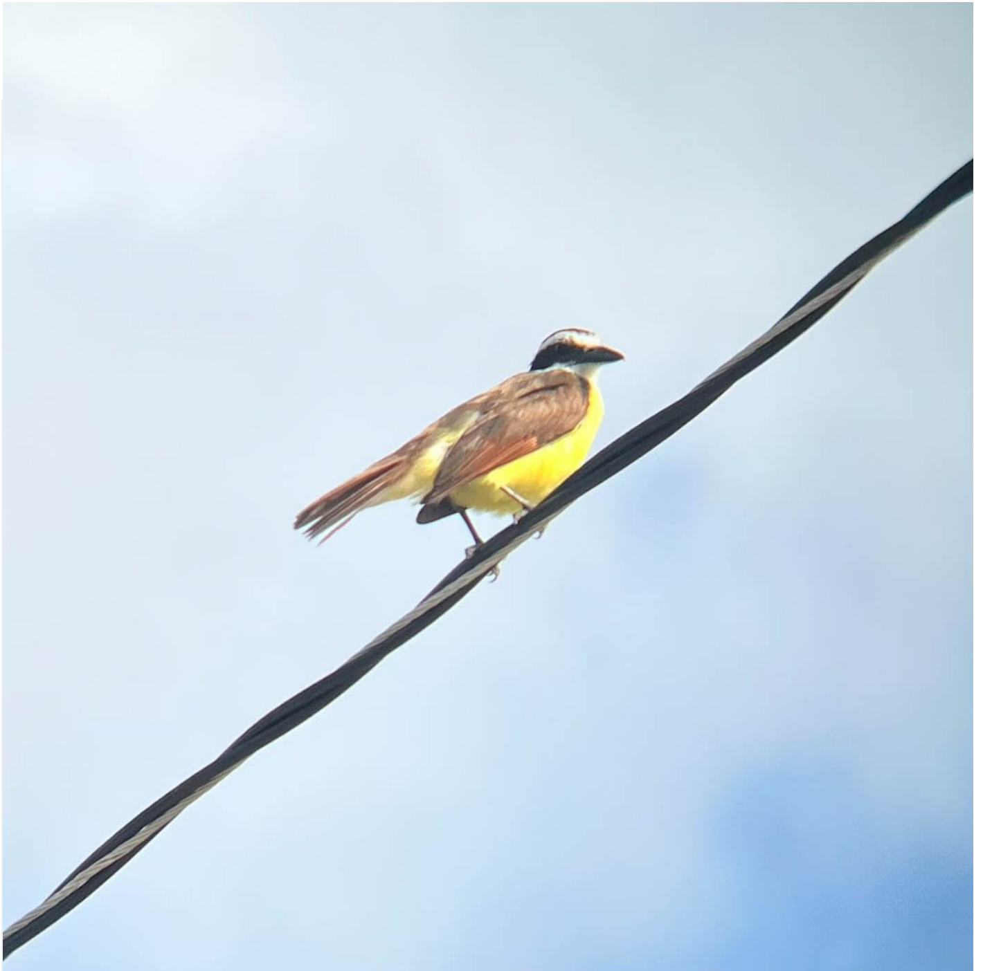
A Great Kiskadee perched on a power line. 07/03/2022