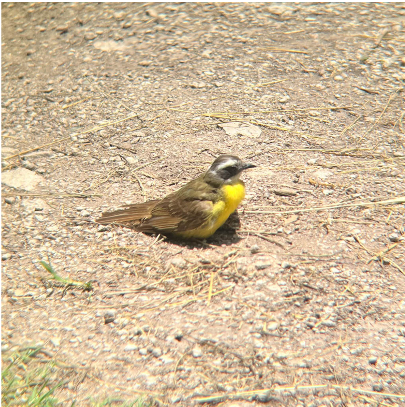
Time for a dust bath. Digiscoped with binoculars. 07/03/2022