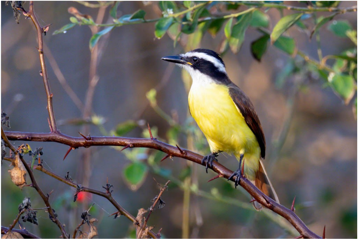
A Kiskadee perched on a thorny branch in South Padre Island | 01/08/2023